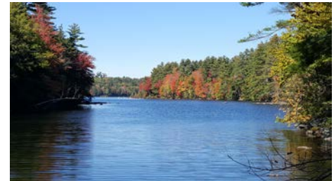
Looking north from the dam, photo courtesy of Dave Markovchick (October, 2017)